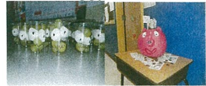
Protecting our Money Bags!